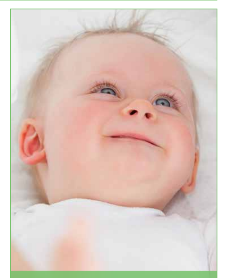
Plan Smart can make being a new parent more rewarding!

If you ever feel uncertain about your parenting skills or whether you're doing what's best for your child, we can easily arrange counselling (face-to-face, over the phone, or through the Internet).