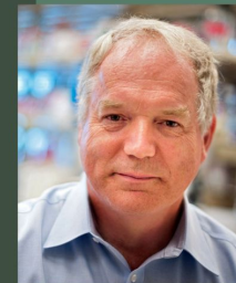
Nobel Prize Laureate Dr. Michael Houghton

Introduction to Discovery Learning Discovery Learning 1 Discovery Learning 2 Objective Structured Clinical Examination (OSCE) Simulation Residents: Life and Service