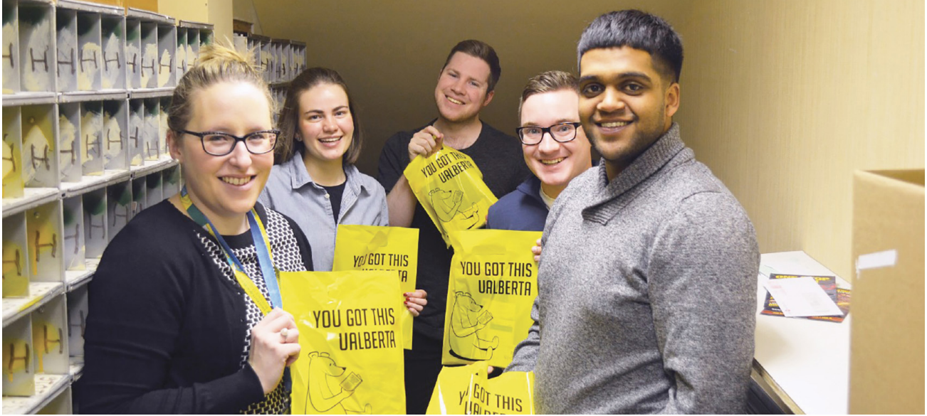
Student Care Packages