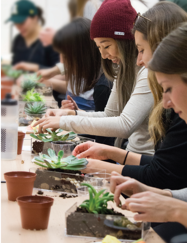
Build Your Own Terrarium Event 2017

regardless of age, ancestry, gender, gender identity and expression, sexual orientation, or any other protected ground at the U of A.