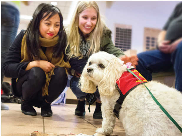
Chimo ATT event at SUB, "Puppy Therapy"

a function of factors such as fitness, nutrition, use of drugs or alcohol, access to medical care, and quality of sleep. Developing an environment where healthy choices are the easy choices can contribute to the overall physical health of a population. This means providing access to resources for physical activity, affordable, healthy food options, health information, quality health services, and comprehensive employee health benefits, including an employee and family assistance program.