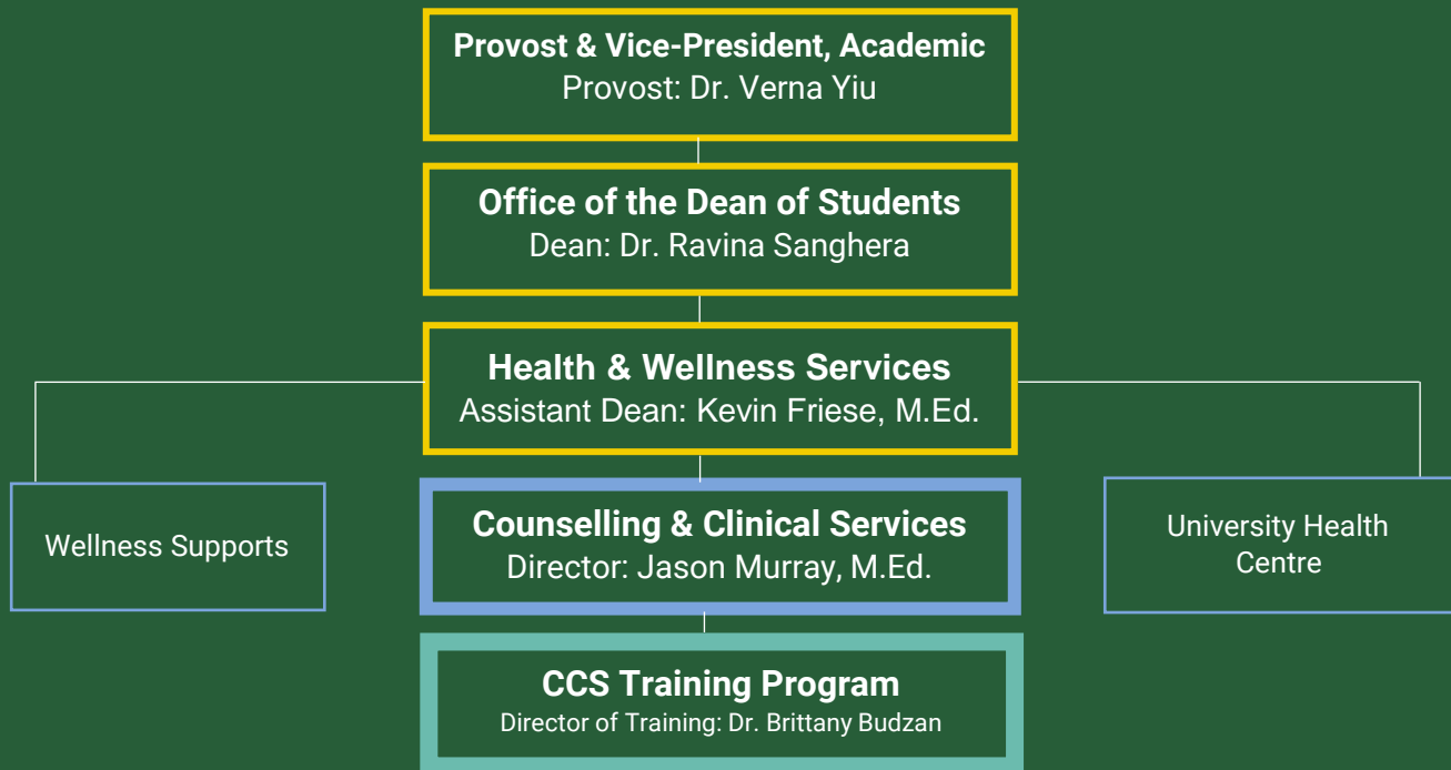
Figure 1. Organizational Structure of Counselling & Clinical Services

CCS is a branch of the Office of the Dean of Students within the University of Alberta. CCS is a multidisciplinary professional agency staffed by 15 registered psychologists, three social workers, three to six psychologists-in-training who are supervised by senior staff, eight part-time psychiatrists, two mental health consultants (MHCs), and four administrative support staff. Our services are available to all students who pay student services fees, and individual counselling sessions are available at no additional cost to the student. Students are seen primarily for individual and group counselling; we also provide couples counseling, workshops for students or staff, consultation and, less frequently, vocational testing. Presently CCS serves a student body of approximately 40,100 students from 156 countries.