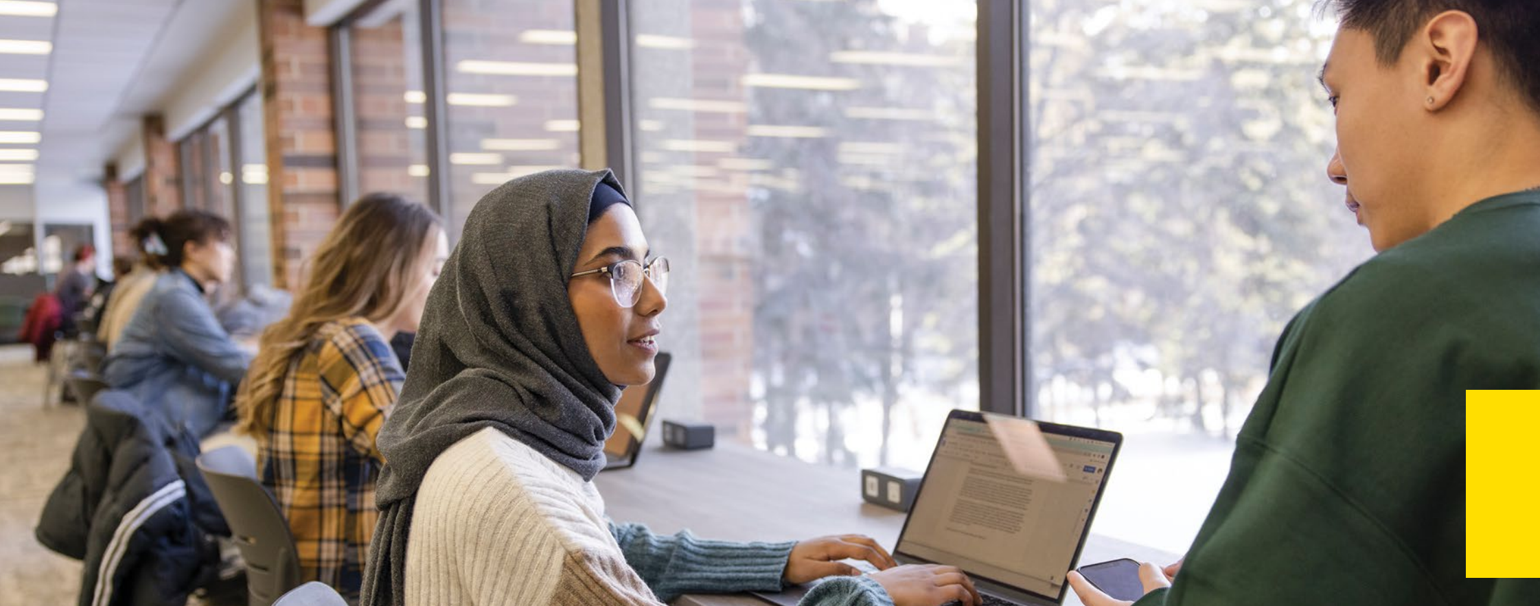
A group of students studying at Rutherford North Library.

Students now have the option to spend their first two years of study in the BEd Elementary program at the Augustana Campus in Camrose and the final two years at the North Campus in the Faculty of Education.