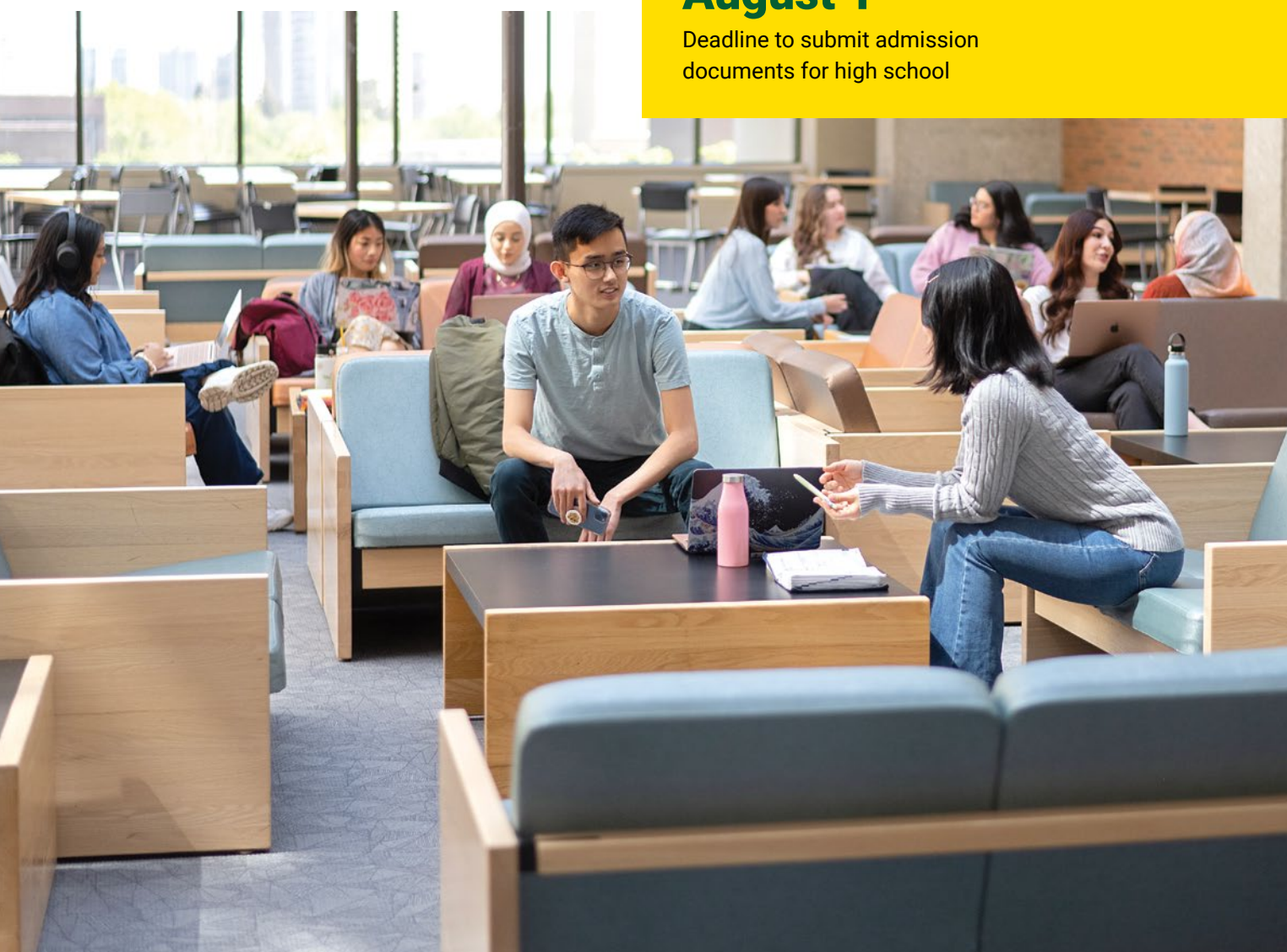
Education students at the 4th floor student lounge in Education Centre North.