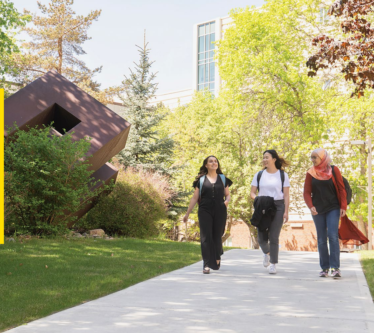
Education students walking to class at the U of A.

in awe of the power of education to change lives. It's why we are dedicated to preparing the next generation of teachers, scholars and leaders to take hold of opportunity – and transform it for a better tomorrow.