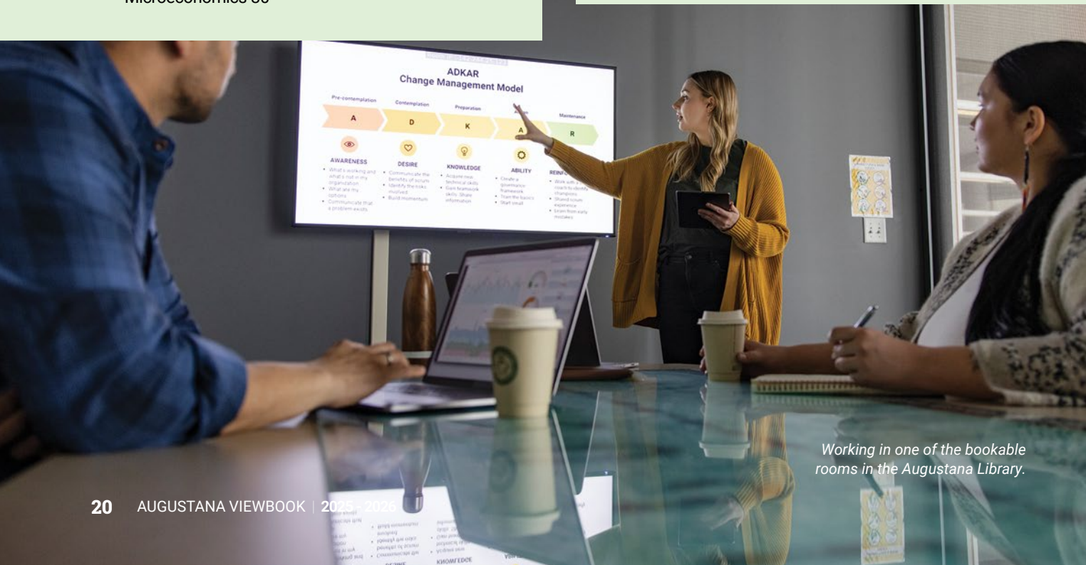
Working in one of the bookable rooms in the Augustana Library.

Interested in a professional program or graduate studies? Learn more about University of Alberta programs within other faculties at uab.ca/programs