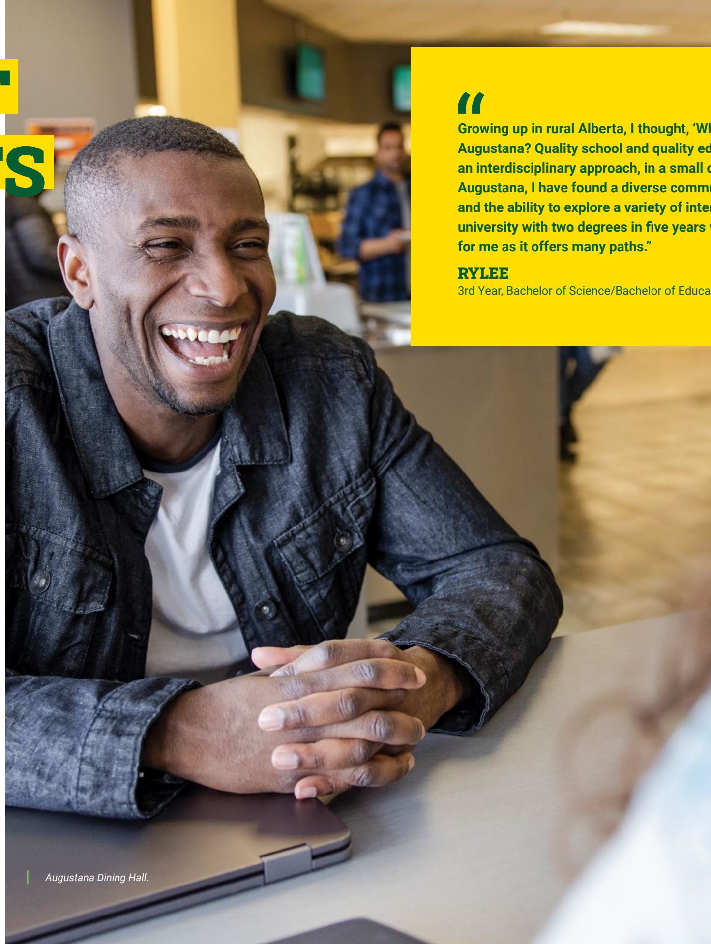
Augustana Dining Hall.