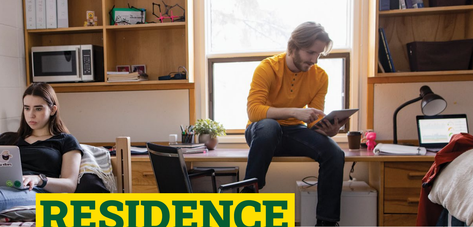
Studying in Augustana dorm room.