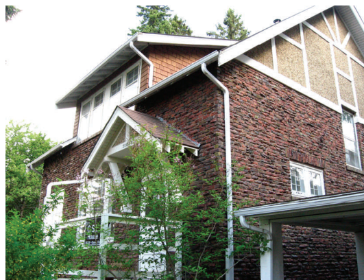
CSL House, 11039 Saskatchewan Drive