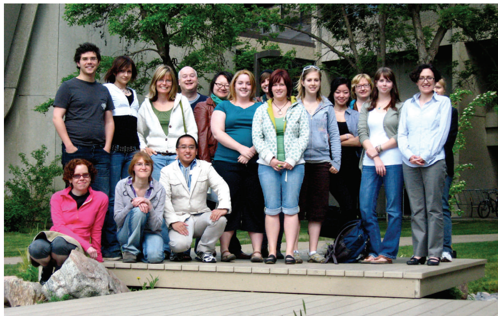
Spring Immersion Class of 2009