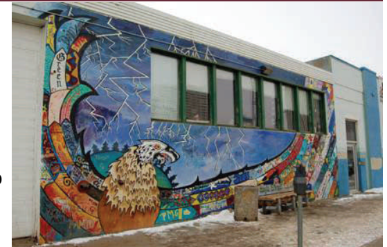
The Learning Centre, home of Humanities 101 classes

Hum101 will offer more courses next year at The Learning Centre downtown. The program enriches not only those in society who have been left out, marginalised, or denied access to post-secondary education, but also the University community. As more than one instructor noted this year, "I hope students learned as much from me as I did from them."